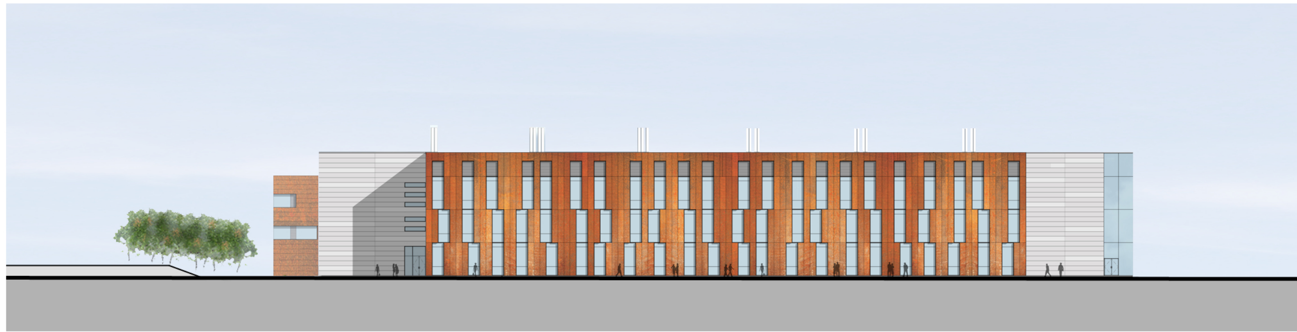
Proposed site section D

The use of this data by the recipient acts as an agreement of the following statements. Do not use this data if you do not agree with any of the following statements. All drawings are based upon site information supplied by third parties and as such their accuracy cannot be guaranteed. All features are approximate and subject to clarification by a detailed topographical survey, statutory service enquiries and confirmation of the legal boundaries. The controlled version of this drawing should be viewed in DWG or PDF format not DWG or other formats. Where this drawing has been based upon Ordnance Survey data, it has been reproduced under the terms of Ryder Licence No. 10000114. Reproduction of this drawing in whole or in part is prohibited without the prior permission of Ordnance Survey. Do not scale the drawing. Use figured dimensions in all cases. Check all dimensions on site. Report any discrepancies in writing to Ryder before proceeding.