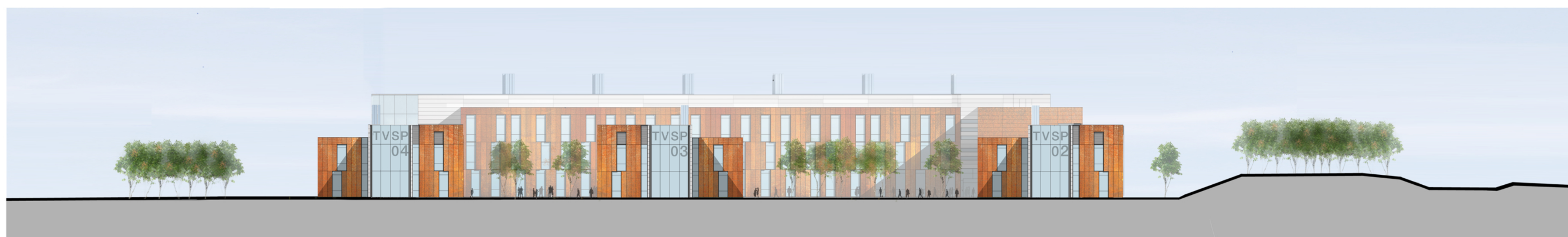
Proposed site section F